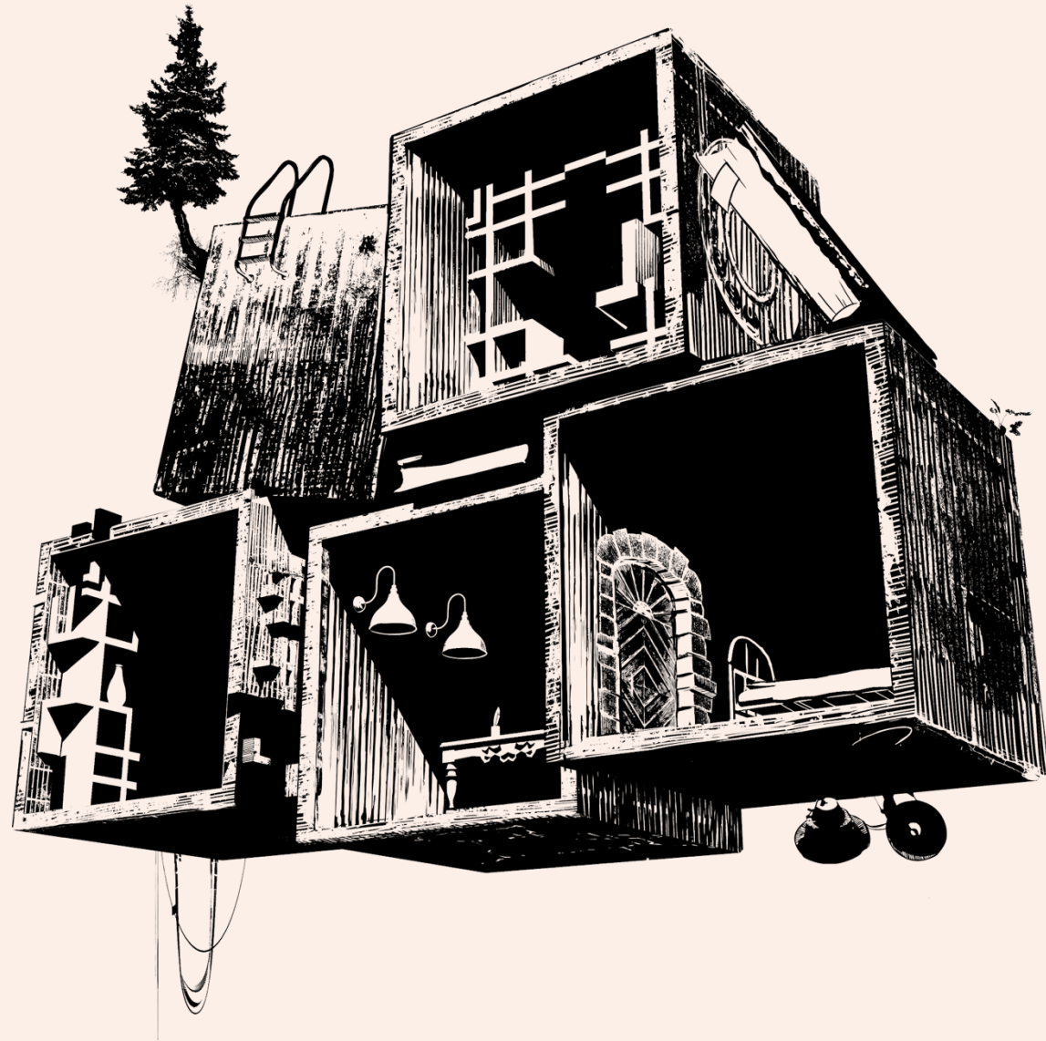
Illustration and logo : Thomas Crausaz